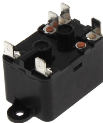
White Rodgers 90-3708 or equivalent Single Pole Double Throw Relay

Refer to the Rinnai Hydronic Air Handler Installation and Operation Manual for more information on setting speeds.